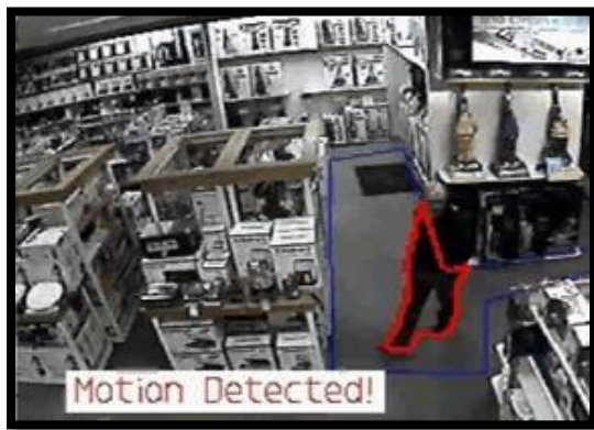
FIGURE 1. VIDEO FRAME ALERT FOR SIMPLE MOTION DETECTION

becoming more realistic about its strengths and drawbacks. Still considered an emerging field, video analytics can assist human observation by providing alerts to defined events, such as motion detection, crossing a “virtual tripwire,” or more sophisticated activity such as gathering crowds, directional motion, or objects removed or left behind. Simple video analytics can be placed in edge devices (either in or connected to the camera), while more complex analysis is typically performed by more powerful computer processor’s within the system’s servers and storage equipment.