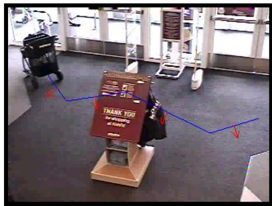
FIGURE 2. VIDEO FRAME DEPICTING “VIRTUAL TRIPWIRE” AND MONITORING DIRECTION OF MOTION

More complex alerts are also available—for example: monitoring for abandoned objects to assist in identifying suspicious packages left behind by a person; person threshold counting